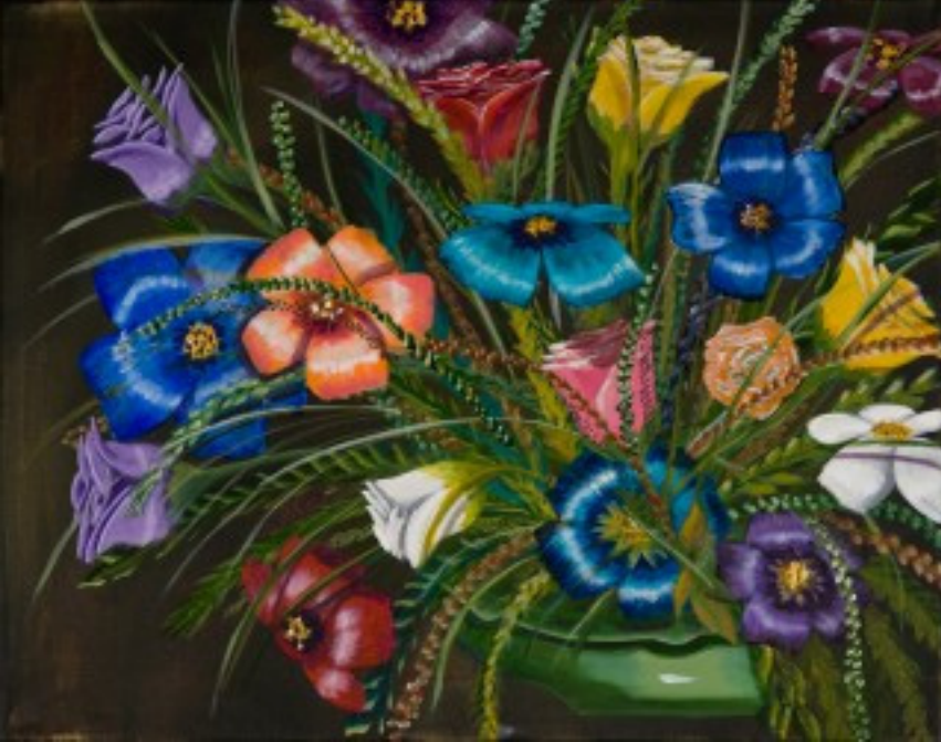
Bouquet in Green Vase

in acrylics. I will eventually explore landscapes and branch out into different styles.