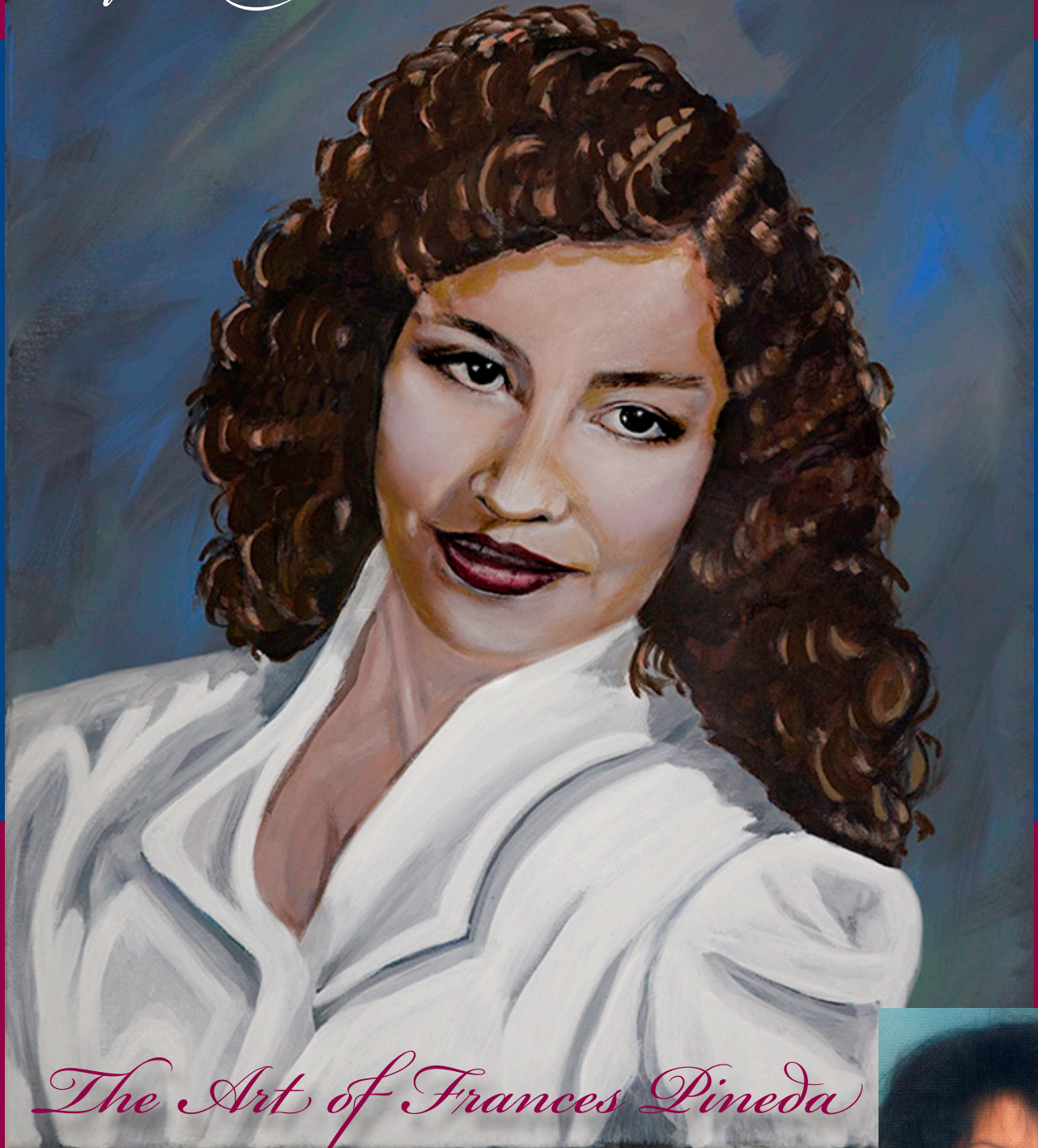
Mom at 18