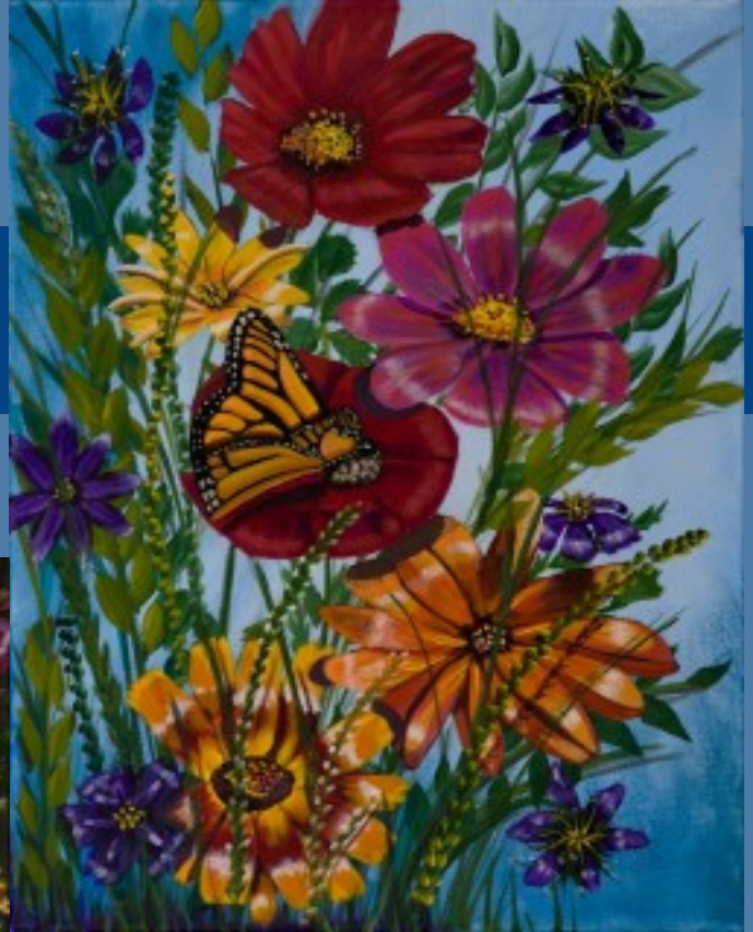
Butterfly on Flowers