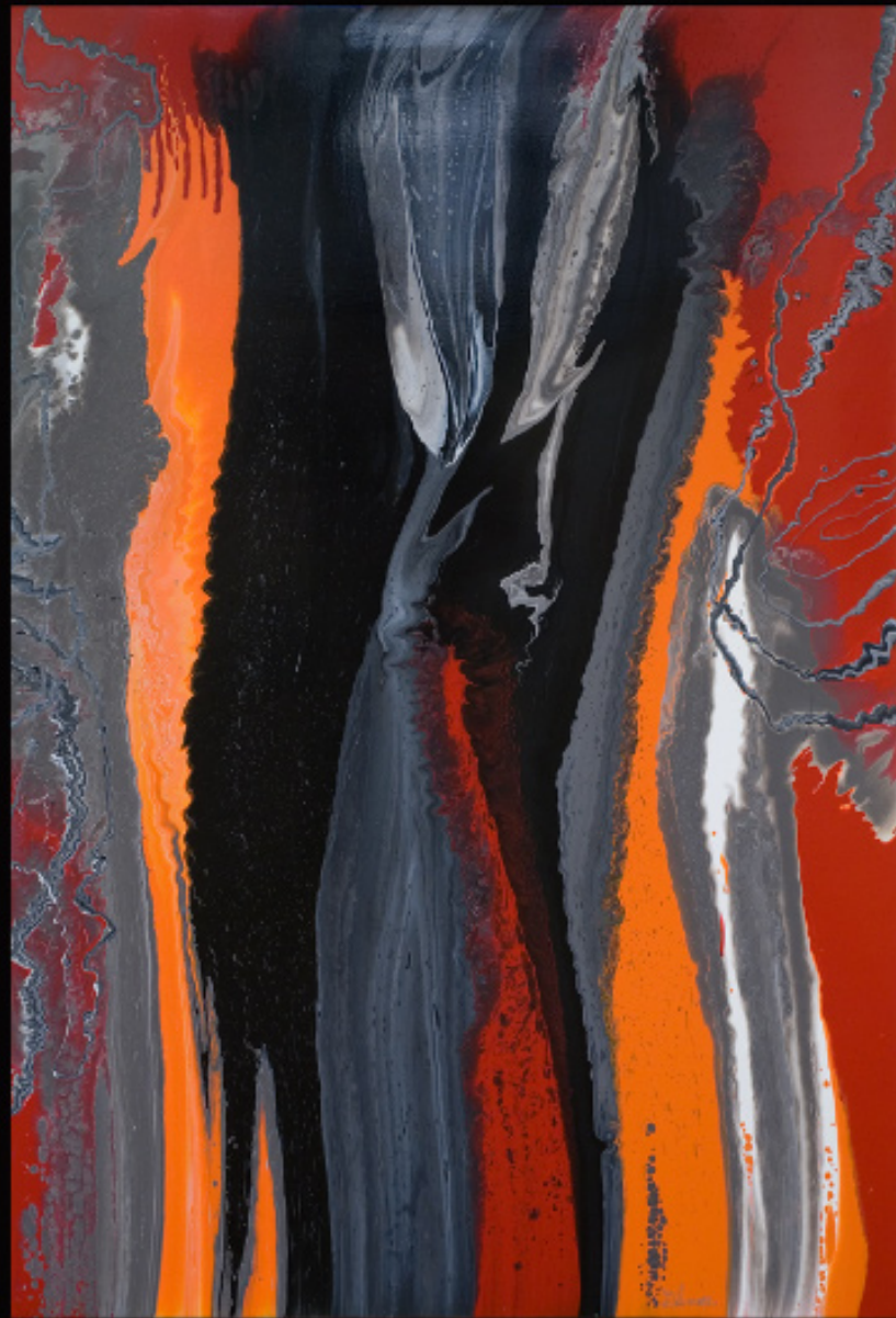
Horse Opera 48"x72"

I paint with the extreme passion of my art form. I wake up everyday on fire to create a new piece of art. I really feel blessed to have been given this ability to do what I love. I wonder sometimes why it took me this long to find my passion.