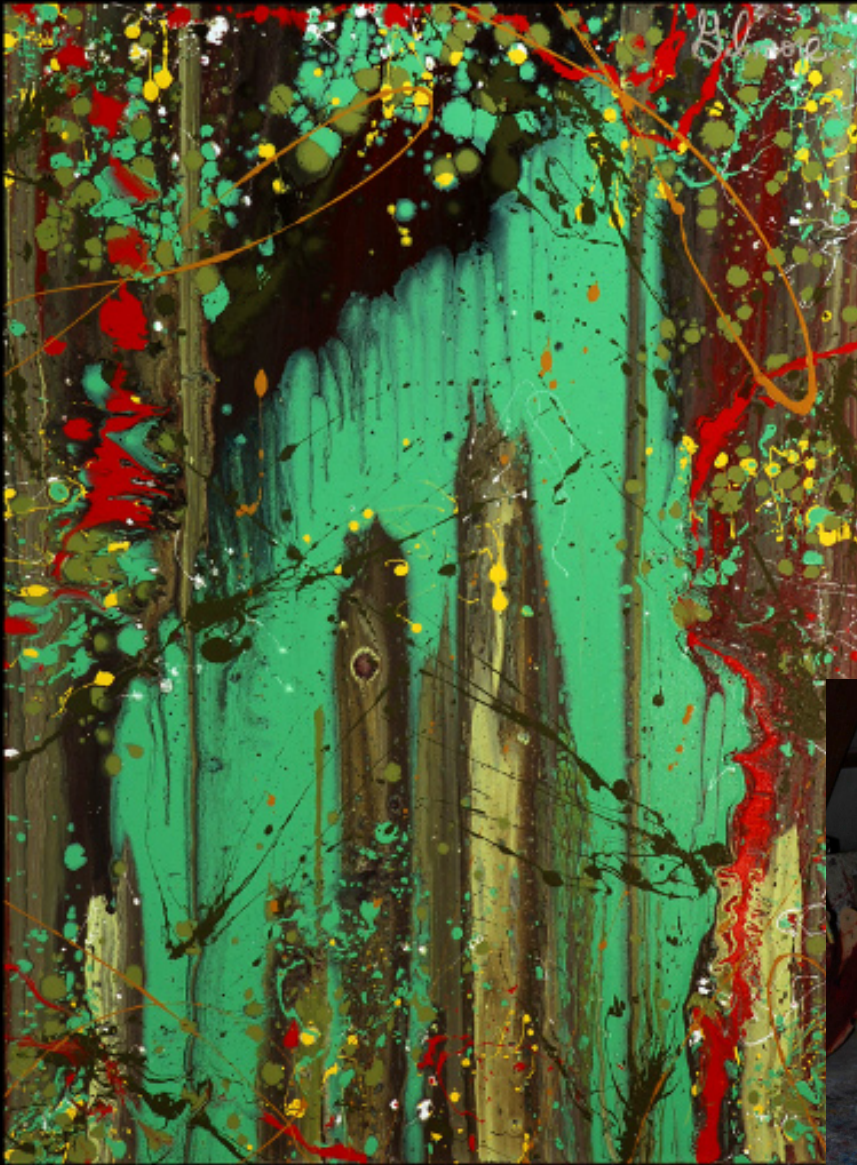
Twin Towers 30"x40"