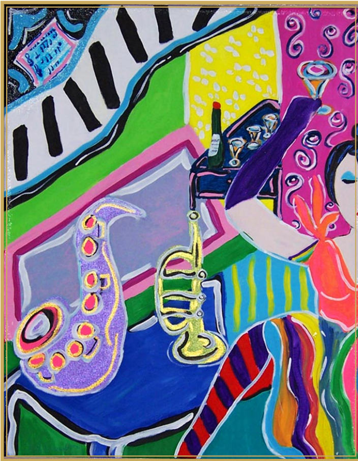
A lady who lived in New Orleans and moved to Florida after Hurricane Katrina bought Viva la Jazz . She said it reminded her of home.