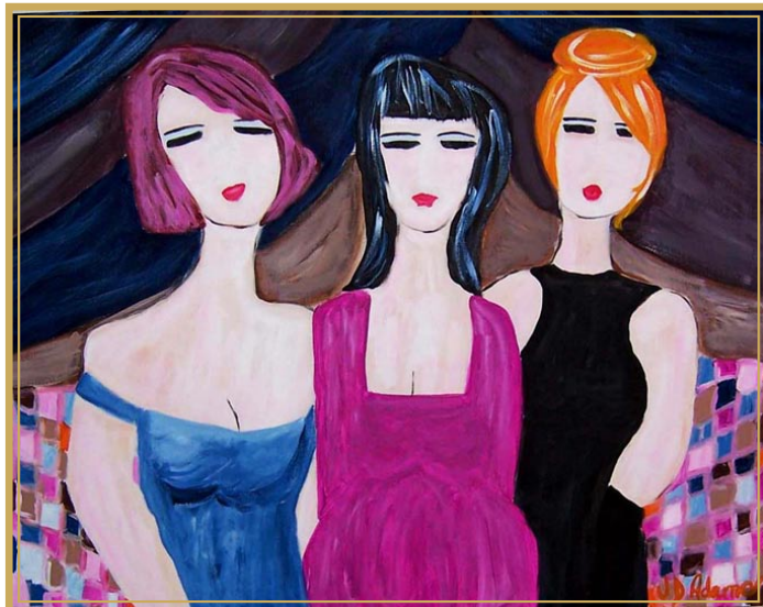
Lean On Me