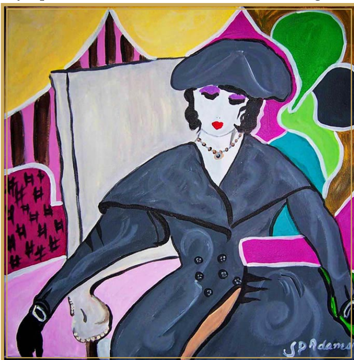
All Trenchy in Vogue