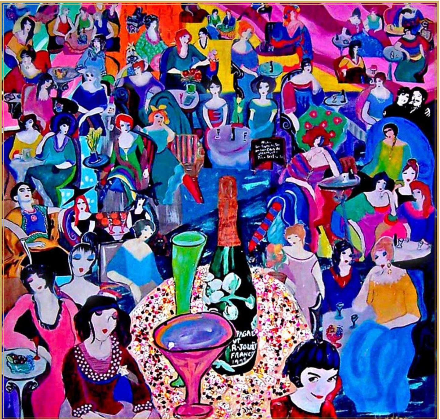
Something to Celebrate

"This is just the beginning of my art career. I look forward to spending many years with a paintbrush in my hand creating more whimsical characters to add to my family. Thank you, FAR, for being a part of this new career!"