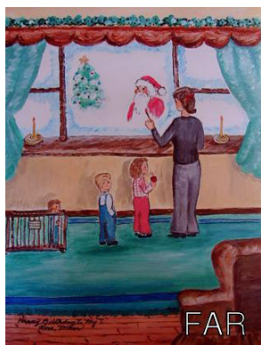
Lewis Rd. Christmas 1963 GWEN HOWLETT